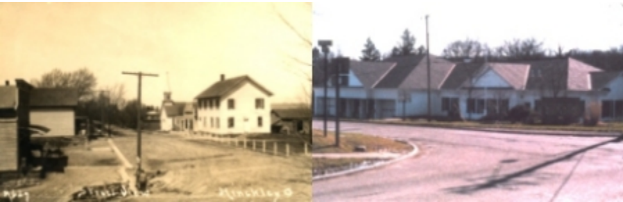
Left: Town Hall circa 1900; Right: Town Hall today

"As the pioneers from the East began to move westward, the Judge was quick to place his holding in other parts of the Western Reserve for sale. He was in no particular hurry to dispose of his Hinckley holdings because they were of less value and Hinckley remained a wilderness for quite a while after adjoining townships had been settled."